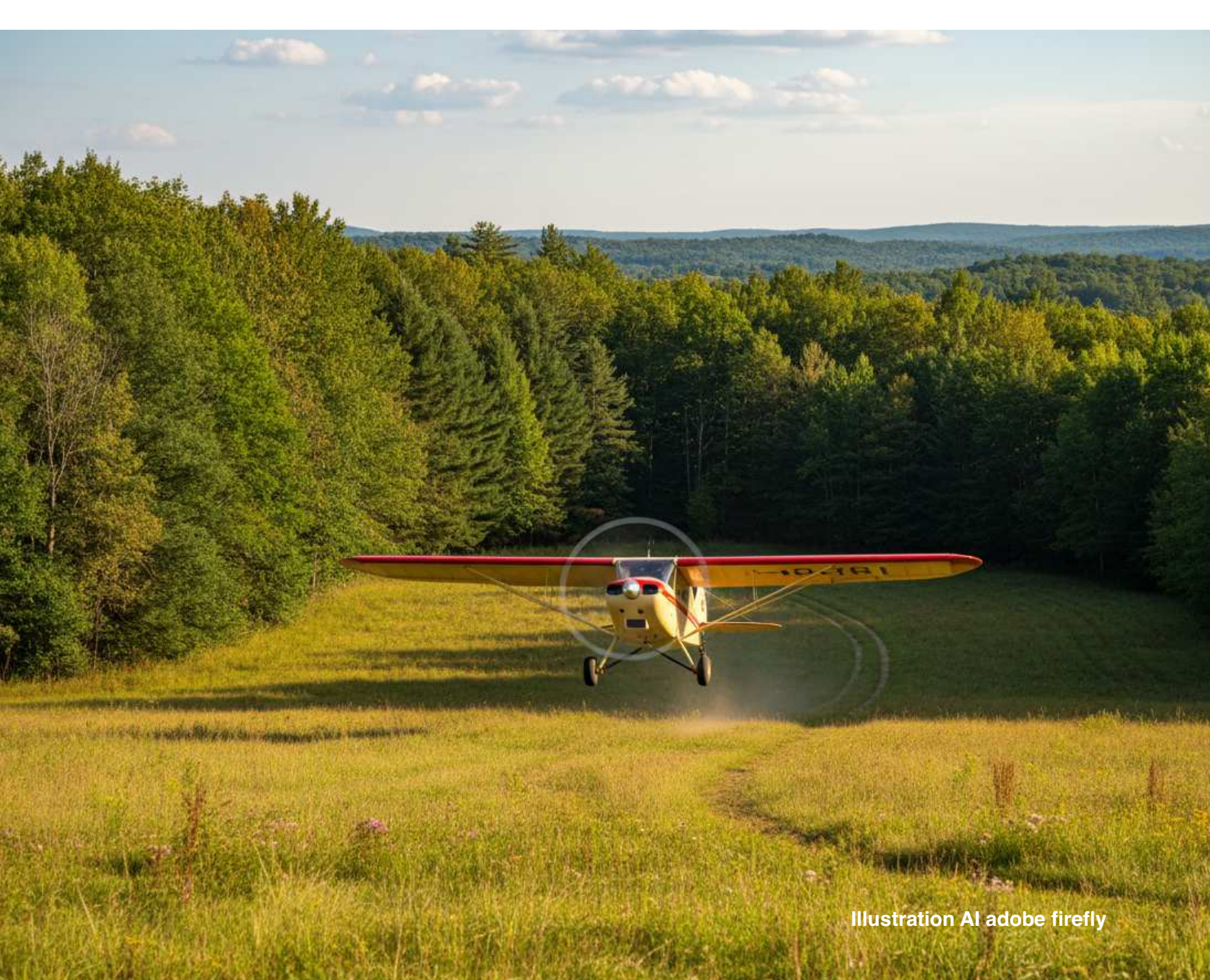
Illustration AI adobe firefly

My (then) partner had taken some flying lessons with a view to enhancing her chances of survival, should I pop my clogs during a flight! So, I let her navigate, as it would be an easy flight and good practice VFR nav work. The route was an easy one, basically heading north from Benwaters and pretty much following the road to Framlingham then east of Diss etc.